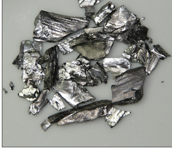
Figure 1. Fragments of refined Ta metal. The pieces in this photo represent about 20 grams of Ta.

Miniaturized electronics, such as smartphones and other smart devices, require Ta for high-efficiency capacitors.