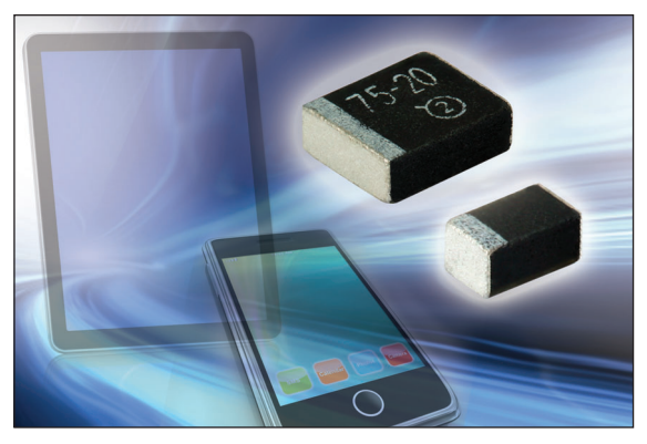
Figure 2. Ta capacitors are essential components of miniaturized electronics, such as smartphones.