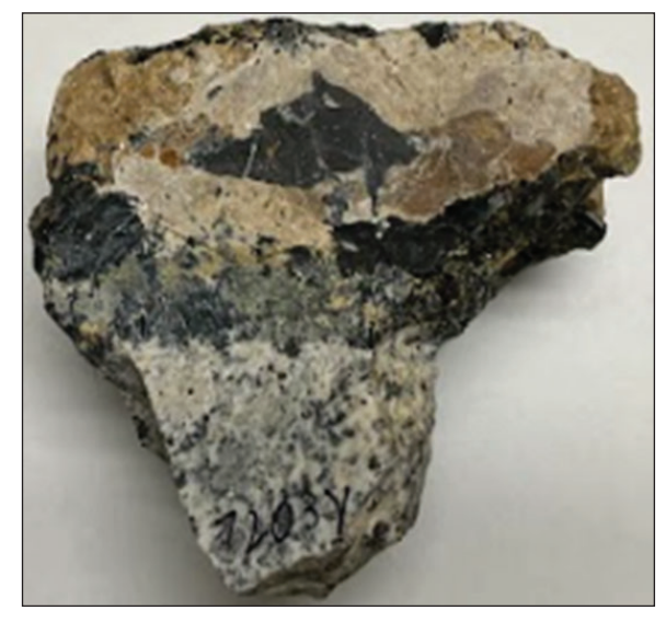
Figure 4. A Nb- and Ta-bearing specimen of the Sheep Creek Carbonatite, Ravalli County, Montana. The upper part of the sample is carbonatite with pinkish calcite surrounding a large black crystal of Ta-bearing columbite. The lower part of the sample is the host rock for the carbonatite intrusion. Field of view is 11 cm.