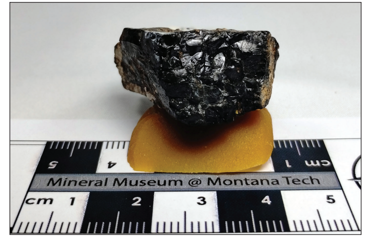
Figure 3. A specimen of fergusonite from the Sappington Pegmatite, Madison County, Montana.

Ta is typically mined at grades of 0.01 to 0.04 wt.% Ta_2O_5 equivalent. Deposits that are easier to mine and