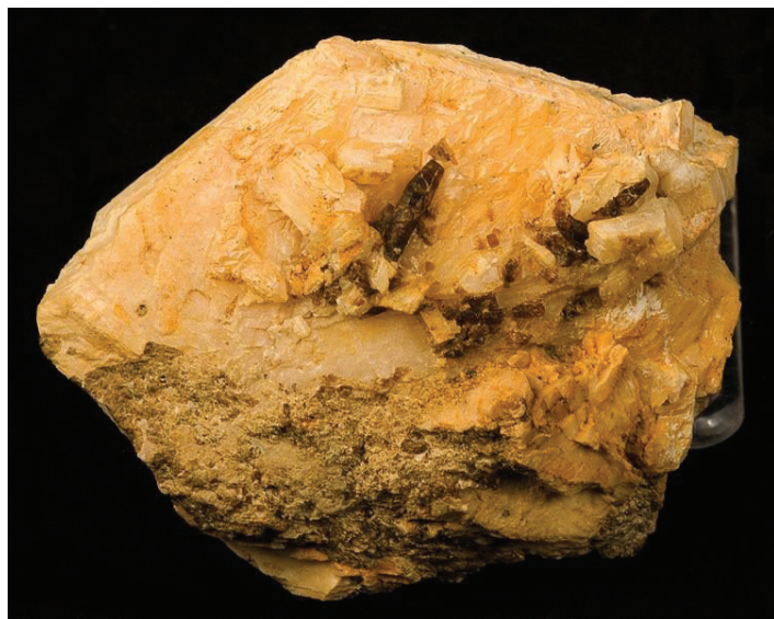
Figure 2. Photo of REE ore consisting of dark brown parisite crystals in pinkish calcite from the Snowbird Mine, Mineral Co., Montana. Sample is about 7.1 cm x 5.7 cm.

Given its extreme rarity and niche uses, there are no comprehensive data on pricing or consumption of Lu. Lu is derived from any deposit where any other REEs are also present in economic quantities. Most REEs come from dedicated REE mines, but the world's largest REE mine, Bayan Obo in China, is actually an iron ore mine with REE byproducts. Grades of Lu in REE deposits range from 0.0001 to 0.005 wt.%. The proportion of Lu in the total REE grade is a function of the deposit type.