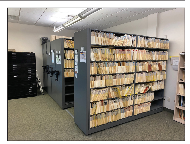
A portion of the Data Preservation archives.

The Philipsburg Mining District in southwest Montana (fig. 1), one of Montana's top historic Ag producers, is a great target for evaluating critical commodity potential and archiving rock samples from a region of reported occurrences (e.g., Cu, Ag, W, Mo, Pb, Zn, Au). This E-MRI data preservation project will photograph and create metadata for 200 samples from the Philipsburg District, and submit sample splits to the USGS for bulk geochemical analyses. Remaining samples will be permanently archived by the MBMG for future researchers. This project presents an opportunity for MBMG and USGS professionals to collaborate with Montana Tech students and professors, and the public availability of these data will be of great interest to mining companies and the general public.