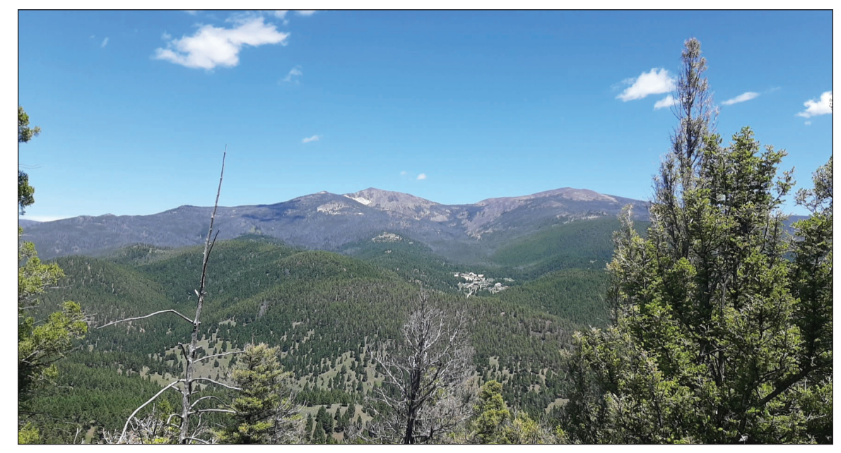
View of the Elkhorn Mining District and the peaks, looking north.