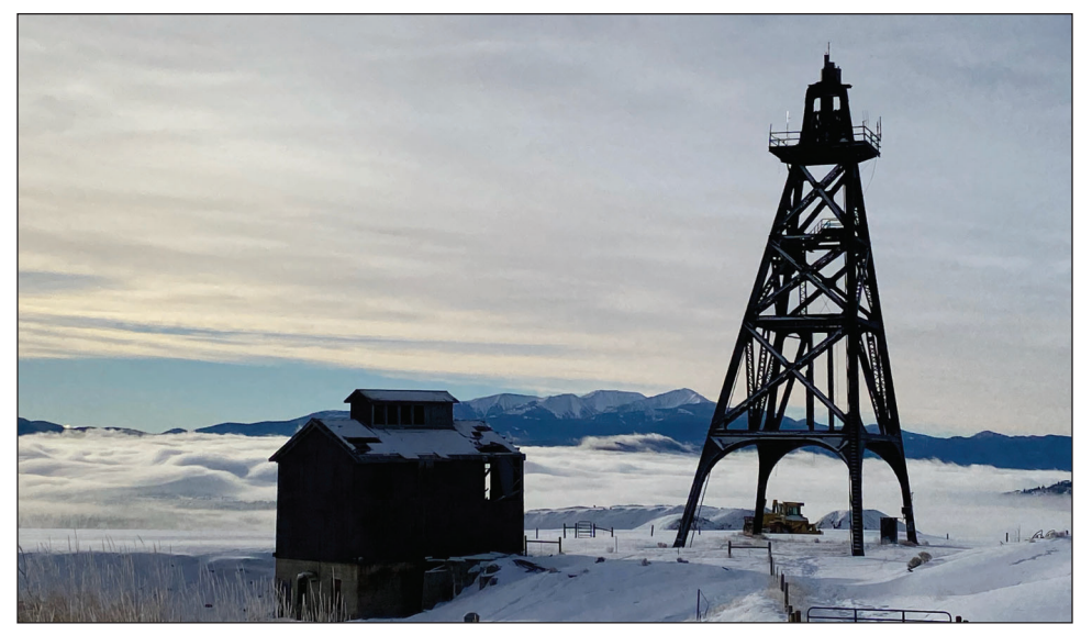
Headframe rising above the fog in Butte, Montana.

The airborne geophysical survey will provide valuable information about the geology below the ground surface. This new information will be combined with geologic mapping and sampling by the Montana Bureau of Mines and Geology to develop an improved understanding of the fundamental geologic framework underpinning the mining districts, which will help industry determine the potential for undiscovered critical minerals including As, Sb, Te, Bi, Sn, Ga, and W, and potentially Re, U, REE, Zr, Hf, Nb, Ta, Be, Li, Co, and Ga, and associated co- and by-product commodities (base, precious, and industrial minerals).