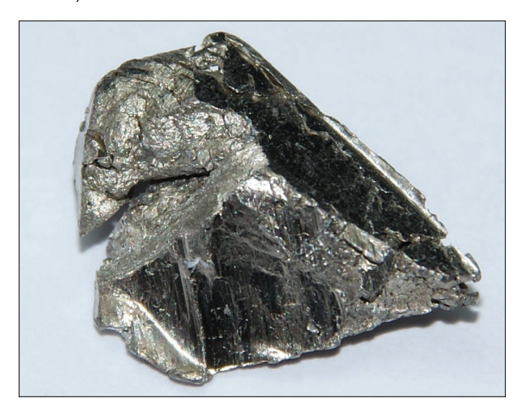
Figure 1. A 2-gram sample of refined Yb metal.

It is a silvery-white metal used in stainless steel alloys, lasers, nuclear medicine, and radiology (as a portable X-ray source).