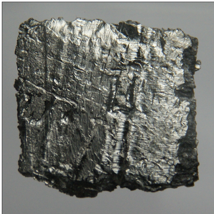
Figure 1. A 9.5-gram sample of refined Er metal.

The soft, silvery gray metal is used in fiber optics, medical lasers, exotic alloys, and nuclear control rods.