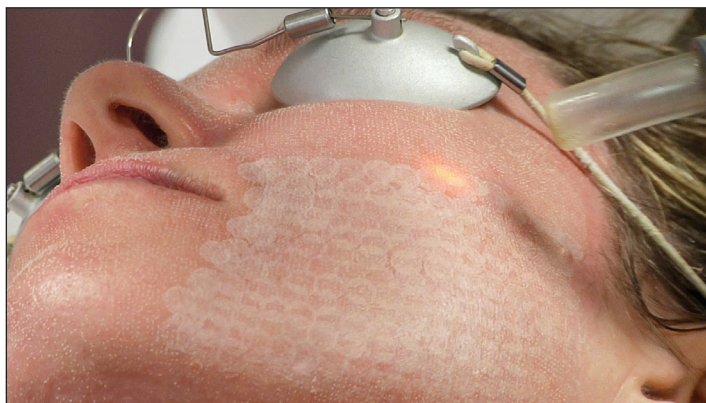
Figure 2. An Er-Y garnet laser (right foreground) being used to treat a facial skin condition. The specific wavelengths that Er-doped lasers produce are well suited to ablating surficial organic tissues.

Given its extreme rarity and niche uses, there are no comprehensive data on pricing or consumption of Er. Er is derived from any deposit where other REEs are also present in economic quantities. Most of the world's Er is mined from clay deposits in southern China under environmentally damaging conditions. Grades of Er in REE deposits range from 0.0004 (Montviel, Quebec) to 0.0419 (Browns Range, Australia) wt.%. The proportion of Er in the total REE grade is a function of the deposit type.