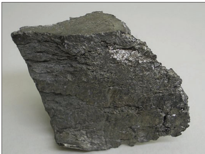
Figure 1. Refined Dy metal.

The silvery metal is used in magnets, alloys, and nuclear control rods. It is the heaviest REE that is commonly considered a "magnet metal" along with neodymium (Nd), praseodymium (Pr), samarium (Sm), and terbium (Tb).