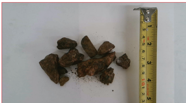
Figure 3. A sample of REE mineralization taken from weathered outcrop in Beaverhead County that has 0.016 wt.% Dy.

Dy has been recovered from unconventional deposits. In southern China, the aforementioned clay deposits formed from tropical weathering and hold low-grade, but easily extracted, amounts of REEs. Another type of uncon-