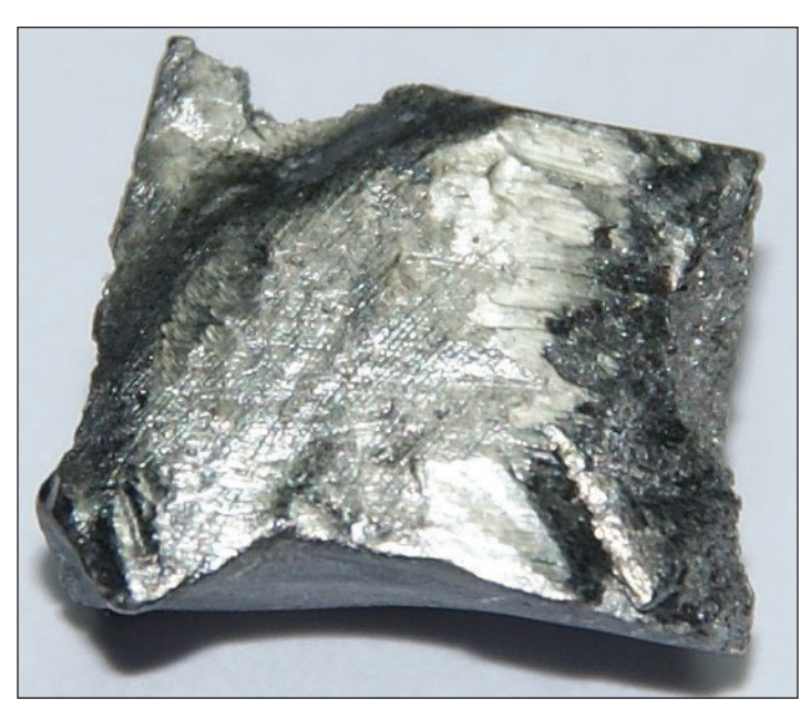
Figure 1. A 3-g sample of refined Tb metal about 1 cm across.

The silvery white, soft, and reactive metal is used in specialty magnetic alloys, but its largest application is as green phosphors for displays or lighting. It is a REE that is commonly considered a "magnet metal" along with neodymium (Nd), praseodymium (Pr), samarium (Sm), and dysprosium (Dy).