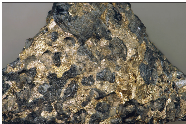
Figure 3. Photograph of a sample of ore from the Johns-Manville (J-M) Reef taken from the Stillwater Mine in the Beartooth Mountains, Stillwater County. Here, reefs are layers in igneous intrusions that are rich in sulfide minerals. The brassy sulfide minerals contain PGEs (primarily Pd and Pt in the ratio 3:1 = Pd:Pt). The enclosed dark glassy minerals are olivine, pyroxene, and chromite. Field of view is ~9.5 cm wide.

Pd can be found as natural alloys of PGEs in a native "nugget" state. It can also occur as sulfide, arsenide, antimonide, or telluride minerals such as braggite, vysotskite, mertieite, stibnopalladinite, or merenskyite. Aside from arsenic (As), antimony (Sb), tellurium (Te), and other PGEs, critical minerals that can be found with Pd are bismuth (Bi), chromium (Cr), cobalt (Co), nickel (Ni), titanium (Ti), and