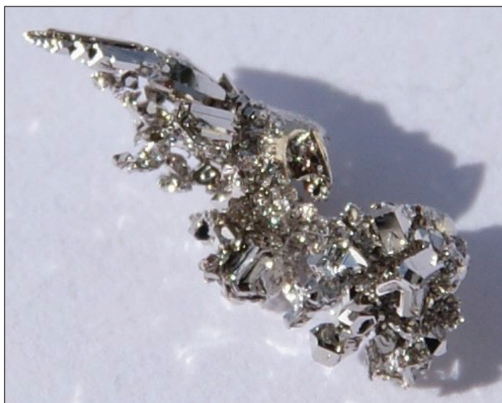
Figure 1. A ~1 gram (0.5 x 1 cm) sample of refined crystallized Pd metal.

Pd is part of the platinum group elements (PGEs). The PGEs are Pd, platinum (Pt), rhodium (Rh), osmium (Os), ruthenium (Ru), and iridium (Ir). Pd and Pt are by far the most abundant of the six. These elements are found together in most natural deposits. They also have similar physical characteristics.