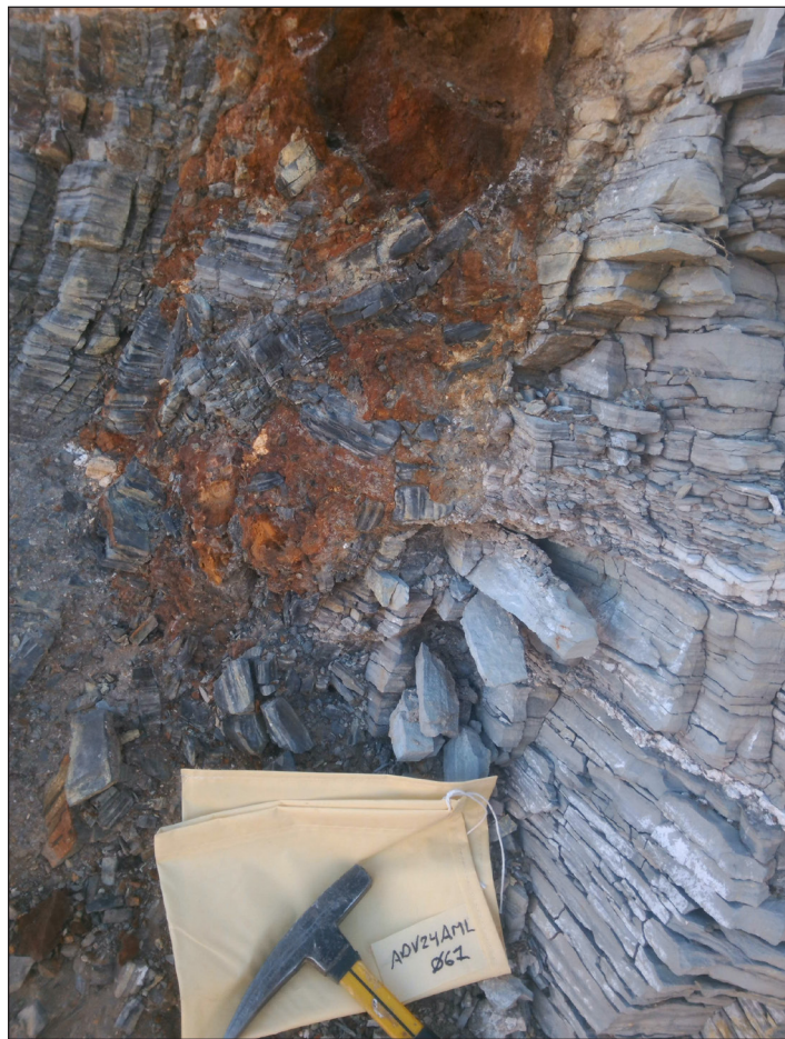
Figure 2. A sample of weathered REE-mineralized carbonatite with 0.034 wt.% Pr, that has intruded shale in Petroleum County, Montana.

Given its relative scarcity and limited production, there are few data on domestic Pr reserves. Pr is derived from any deposit where other, primarily light, REEs are also present in economic quantities. Much of the world's Pr is mined from carbonatite deposits in China. The Mountain Pass Mine has an indicated resource of ~3 million kg of \text{Pr}_2\text{O}_3 . Average grades of Pr in REE resources range from 0.001 (Round Top, Texas) to 0.63 (Steenkampskraal, South Africa) wt.%. The proportion of Pr in the total REE grade is a function of the deposit type. Pr content is typically moderate in all REE deposits except for those hosted in carbonatite, where it is higher. Recent pricing for Pr is ~$56/kg \text{Pr}_2\text{O}_3 .