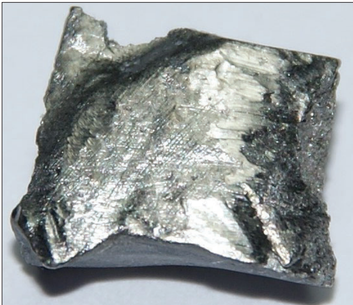
Figure 1. A 3-g sample of refined Tb metal about 1 cm across.

The silvery white, soft, and reactive metal is used in specialty magnetic alloys, but its largest application is as green phosphors for displays or lighting. It is a REE that is commonly considered a "magnet metal" along with neodymium (Nd), praseodymium (Pr), samarium (Sm), and dysprosium (Dy).