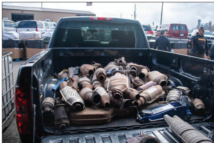
Figure 2. A truckload of stolen Pt-containing catalytic converters seized by law enforcement. These components have a ceramic honeycomb interior sprinkled with PGEs that engine exhaust passes through. The gases are made less toxic by way of chemical reactions catalyzed by the PGEs. Due to the high value of PGEs, such thefts are common.

PGEs are typically reported as combined grades and masses of all six contained metals. South Africa has the largest PGE reserves at 63,000 t (metric tonnes). Russia (5,500 t), Zimbabwe (1,200 t), and the U.S. (820 t) round out the runners-up. In terms of production, South Africa also leads with 120 t Pt in 2023. Other significant producers in 2023 were Russia (23 t), Zimbabwe (19 t), Canada (5.5 t), and the U.S. (2.9 t). Recycling is an important secondary supply, with 9 t recovered domestically, mostly from older catalytic converters. Other entities that refine and export Pt are the European Union and Switzerland. Compare the domestic mining (2.9 t) and recycling (9 t) production