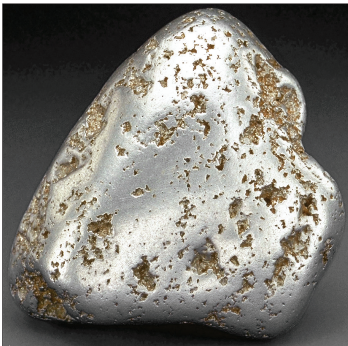
Figure 1. An ~1 lb nugget of native Pt from Russia.

Platinum is part of the platinum group elements (PGEs). The PGEs are Pt, palladium (Pd), rhodium (Rh), osmium (Os), ruthenium (Ru), and iridium (Ir). Pt and Pd are by far the most abundant of the six. These elements are found together in most natural deposits. They also have similar physical characteristics.