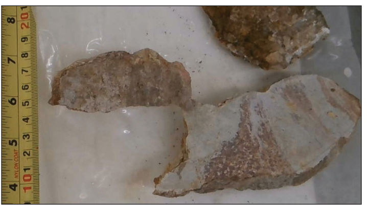
Figure 3. A sample of REE-mineralized carbonatite with ~0.01 wt.% Eu from Ravalli County, Montana.

All REEs, including Eu, co-crystallize in the same minerals due to their geochemical similarities. Ore minerals are typically phosphates or carbonates such as xenotime or parisite, respectively. These occur in exotic intrusive rocks such as carbonatite, peralkaline granitoids, and some types of pegmatite. Other critical minerals that can occur in these rare rock types are fluorspar (CaF<sub>2</sub>), barite (BaSO<sub>4</sub>), niobium (Nb), tantalum (Ta), scandium (Sc), titanium (Ti), and zirconium (Zr). Certain dense REE minerals, specifically xenotime and fergusonite, can resist weathering and become concentrated in placer (mineral sands) deposits along with the other REEs: Zr, Ti, Nb, and Ta.