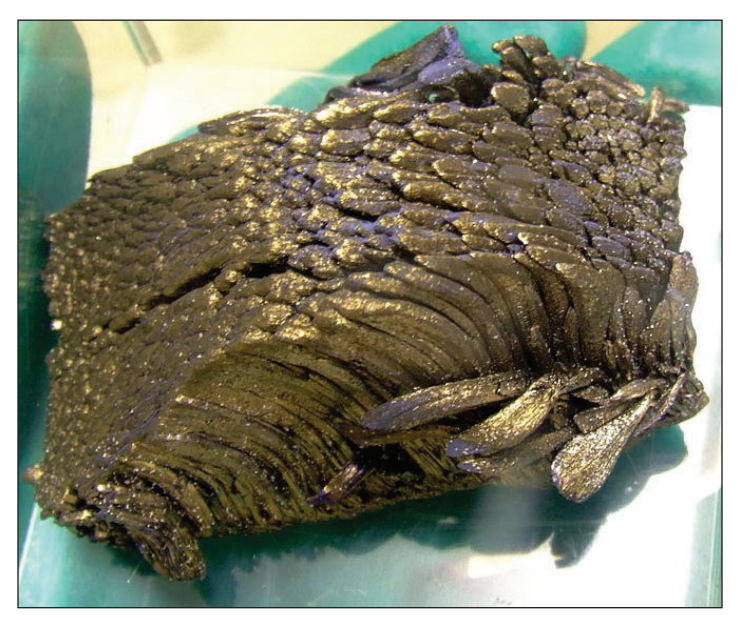
Figure 1. 300 grams of refined Eu metal held in hand.

The silvery white metal is the softest and most chemically reactive of the lanthanides. Eu compounds are excellent phosphors and are common in lighting and electronic displays.