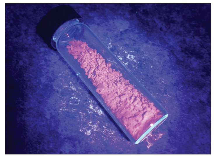
Figure 2. Eu hydroxide under ultraviolet light, glowing with a reddish color that distinguishes many Eu compounds.

Given its relative scarcity and specialty uses, there are few data on national Eu reserves. Eu is derived from any deposit where other REEs are also present in economic quantities. Much of the world's Eu is mined from carbonatite deposits and clay deposits in China under environmentally damaging conditions that would not be allowed in the developed world. Average grades of Eu in REE resources range from 0.00001 (Round Top, Texas) to 0.046 (Mt. Weld, Australia) wt.%. The proportion of Eu in the total REE grade is a function of the deposit type. Eu content is typically negligible in all REE deposits except for