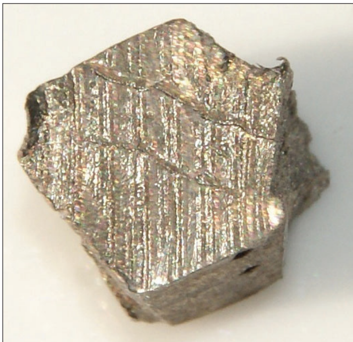
Figure 1. A tarnished sample of refined Nd metal.

The hard and easily tarnished metal is used in lasers and colored glass. Nd is best known for its use in alloys with iron (Fe) and boron (B) to make NdFeB magnets. This is the strongest and most widespread REE magnet. High power-to-weight ratio electric motors or generators necessitate the use of NdFeB magnets in their construction.