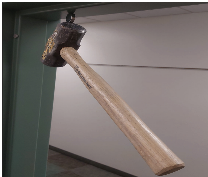
Figure 2. A cylindrical (1" x 0.25") Nd magnet demonstrating its strength holding a small (~6 lb) sledgehammer to a metal door-frame. A conventional (non-REE) ceramic magnet of the same size would not be able to hold this weight. Photo by Adrian Van Rythoven (MBMG).

Given its relative scarcity and limited production, there are few data on domestic Nd reserves. Nd is derived from any deposit where other REEs are also present in economic quantities. Much of the world's Nd is mined from carbonatite deposits in China. The Mountain Pass Mine has an estimated resource of ~55 million kg of Nd 2 O 3 . Average