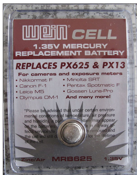
Figure 2. A 1.35 V Zn-air battery. These are commonly used to replace older and toxic mercury battery types.