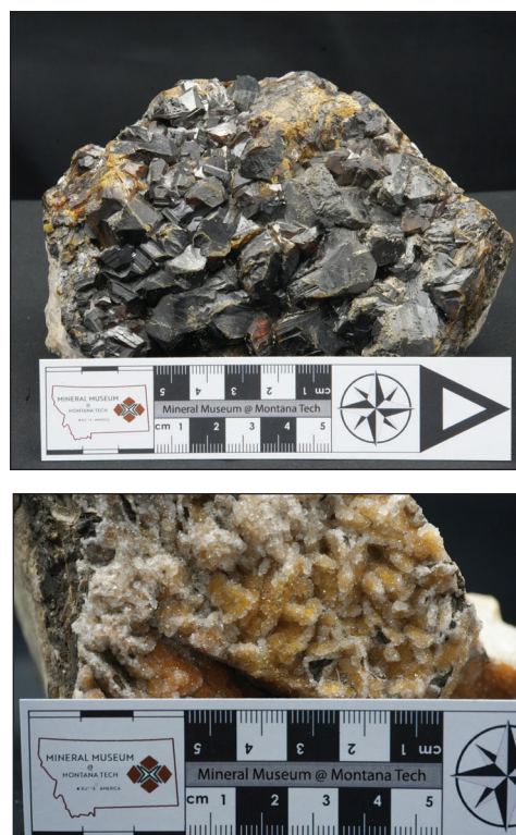
Figure 3. Specimens of sphalerite from the Broadwater Mine, Cascade County, Montana (top) and smithsonite from the Elkhorn Mine, Jefferson County, Montana (bottom).

Most American Zn deposits are Mississippi Valley-Type. Other deposit types include skarns, sedimentary exhalative, stratiform sediment-hosted, carbonate-replacement, and polymetallic vein. Other critical minerals that can occur with Zn in these deposits are germanium (Ge), gallium (Ga), indium (In), bismuth (Bi), barite ( \text{BaSO}_4 ), cobalt (Co), tellurium (Te), antimony (Sb), and arsenic (As).